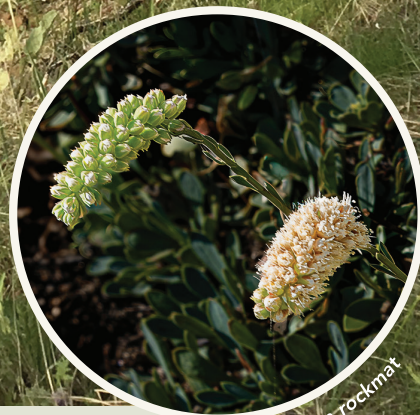
The rare Chelan rockmat is endemic to the Lookout Natural Area