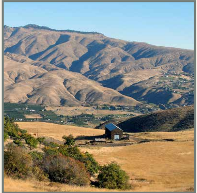
Burts Barn at CDLT's Horse Lake Reserve