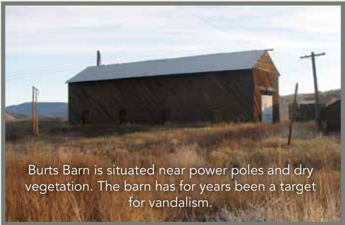
Burts Barn is situated near power poles and dry vegetation. The barn has for years been a target for vandalism.

“The barn that now stands on the ranch was built during 1953 and 1954. Lumber used on the walls was rough and freshly cut at the time it was nailed onto the studs. The gaps between these boards today resulted from shrinking of that green lumber as it dried. Dad was not disappointed about the shrinkage, remarking that the gaps would allow increased air circulation to help dry any hay stored inside. The barn is 100 feet long and 30 feet wide. Its outside walls are 24 feet high.”