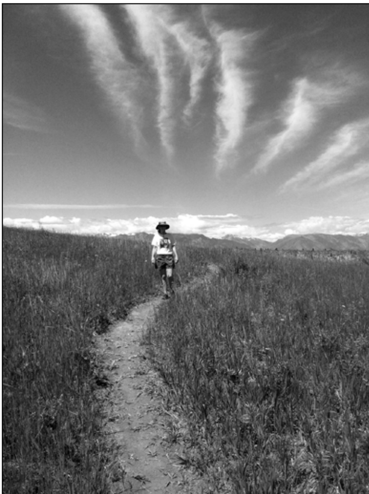
Trail volunteer Robin Boal hiking on the beautiful new Apricot Crisp Trail.

You’ll find the Apricot Crisp Trail by following the Old Ranch Road from the gate, or by taking Homestead Trail to where it connects to the Old Ranch Road. About a quarter of a mile past where the Homestead Trail connects to the Old Ranch Road, you’ll see the new trail taking off to the left, just before you enter a big open field. You can also find a map of the new trail on our website by clicking on the trail maps icon on the home page. Enjoy!