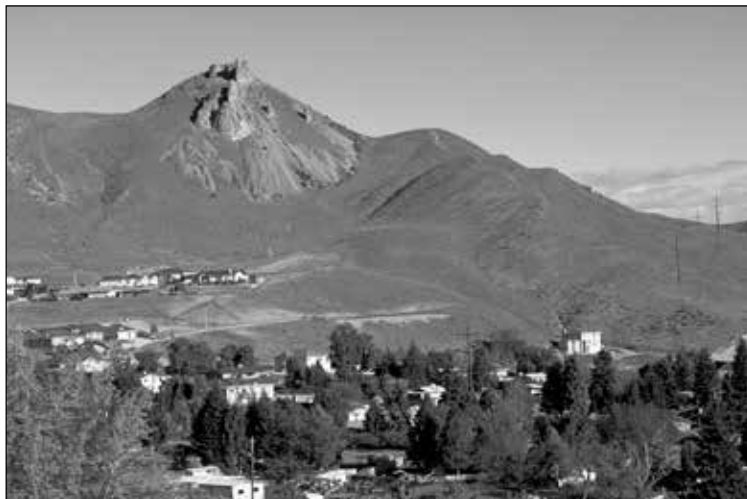
Access to Castle Rock secured!

Like Saddle Rock, this acquisition is a true example of the efforts of many individual donors and supporters and collaboration in a public/private partnership to enhance our community – forever.