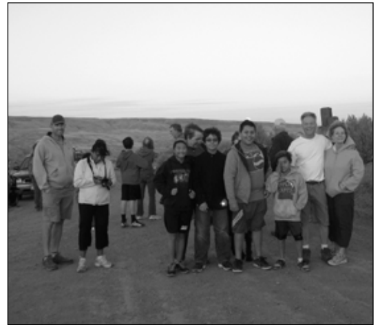
Heading up to the viewpoint for the moonrise and s'mores! Horse Lake Reserve, August 2012

Save the date! This year the dinner will be at the Feshalle in Leavenworth.