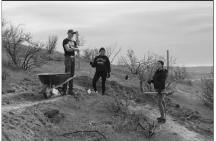
Westside High School student volunteers working on the Sage Hills trail re-route this spring.

The Apricot Crisp Trail is just over a mile long, extending the trail system to the upper portion of the property. It meanders through some wonderful wildflower patches, viewpoints of the Cascade Mountains, big fir trees, and birding territory. The trail was built over several weeks this spring by enthusiastic Land Trust trail volunteers, with significant help donated by Central Washington Evergreen Mountain Bike Alliance, RunWenatchee, and Project Groundwork.